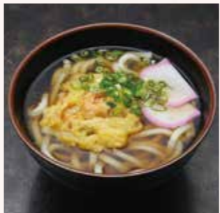
Udon noodle and tempura soup (Fish cake / Green onion / Shrimp)