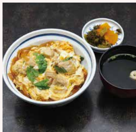
Boiled chicken and egg on rice 780yen

(Egg / Onion / Japanese honeywort Pickles / Clear soup)