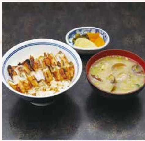
Sea eel on rice and clam miso soup 1,880yen