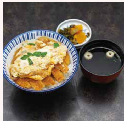
Fried pork and egg on rice 880yen

(Egg / Onion / Japanese honeywort Pickles / Clear soup)