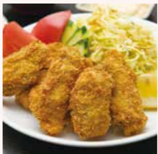
Fried oysters (Cabbage / Cucumber / Fruits Salad dressing / Tartar sauce)