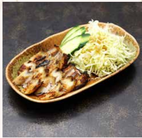
Barbecued sea eel 1,450yen