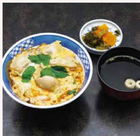
Boiled oysters and egg on rice 980yen

(Egg / Onion / Japanese honeywort Pickles / Clear soup)