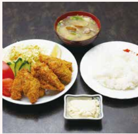
Fried oysters and rice with clam miso soup 1,880yen

(Cabbage / Cucumber / Fruits Fukujinduke / Salad dressing)