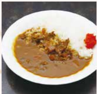
Curry and rice (Onion / Carrot / Fukujinduke)