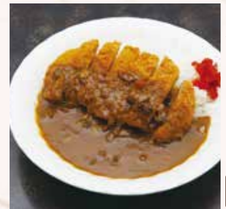
Curry and rice with fried pork (Onion / Carrot / Fukujinduke)