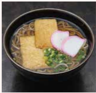
Soba (buckwheat noodle) and fried tofu soup (Fish cake / Green onion)