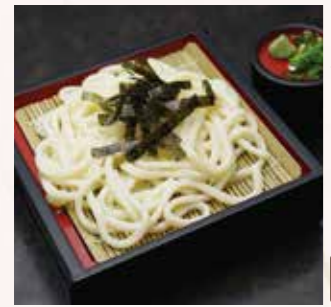
Cold udon noodle with sauce (Wasabi, Green onion, Nori)