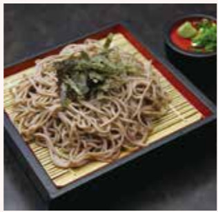
Cold buckwheat noodle with sauce (Wasabi, Green onion, Nori)