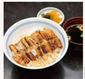
Sea eel on rice (Pickles / Clear soup)