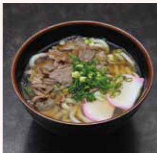
Udon noodle and meat soup (Fish cake / Green onion)