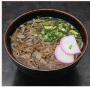
Soba (buckwheat noodle) and meat soup (Fish cake / Green onion)