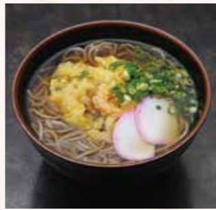
Soba (buckwheat noodle) and tempura soup (Fish cake / Green onion / Shrimp)