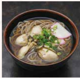
Soba (buckwheat noodle) and oyster soup (Fish cake / Green onion)