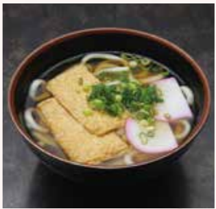
Udon noodle and fried tofu soup (Fish cake / Green onion)